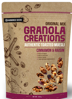
Cinnamon & Raisin