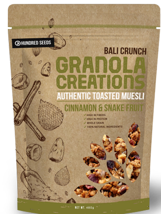
Cinnamon & Snakefruit