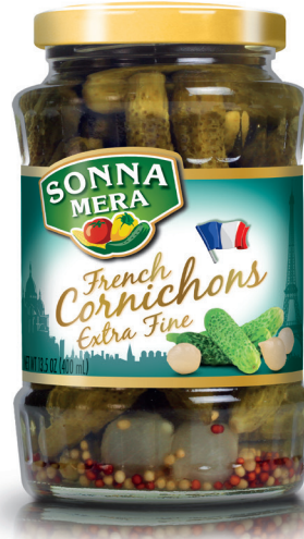
Sonnamera French Cornichons Extra Fine