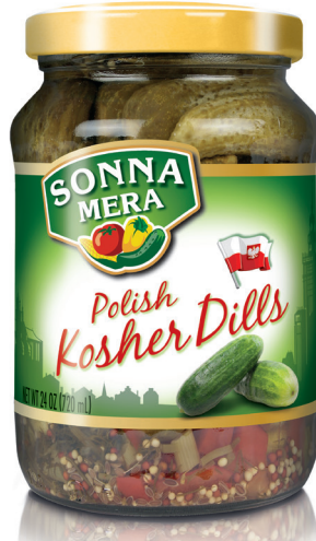
Sonnamera Polish Kosher Dills