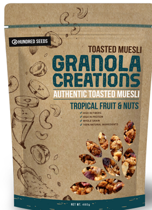
Tropical Fruit & Nuts