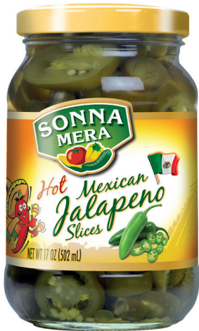
Sonnamera Jalapeno Slices

The Sonnamera pickles range includes Sonnamera Sweet and Sour Gherkins, Jalapenos, Cornichons and several more. Sonnamera pickles are gluten free, lactose-free and suitable for vegetarians.