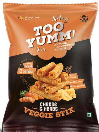
Cheese & Herbs

Too Yumm! Veggie Stix are baked extruded snacks with zero trans fat and protein goodness!