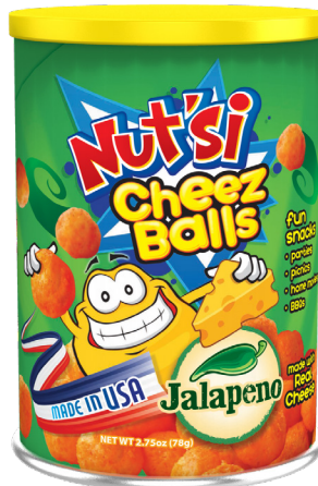
Nut'si Cheeseballs Jalapenos