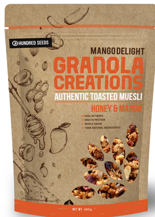
Honey & Mango