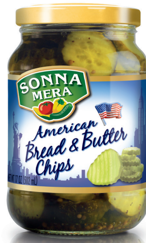
Sonnamera American Bread & Butter Chips