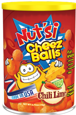
Nut'si Cheeseballs Chilli Lime

Nut'si fun snacks comes in 4 different flavours, chilli lime, jalapenos and real cheese. A favourite snack for the young and old alike!