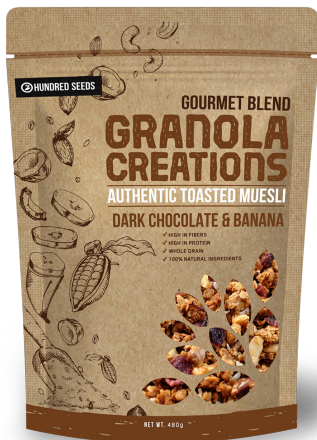
Dark Chocolate & Banana

High in fibres, High in Proteins, Whole Grain granolas and 100% natural ingredients. Comes in 5 different flavours.