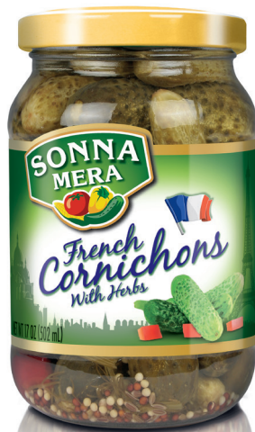
Sonnamera French Cornichons with Herbs