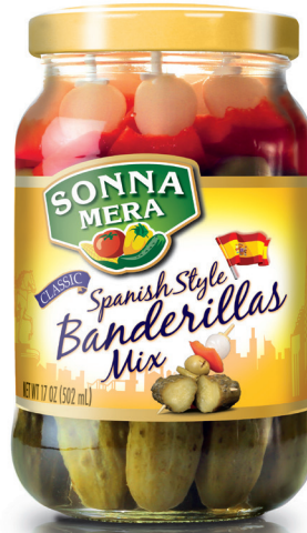
Sonnamera Spanish Style Banderillas Mix