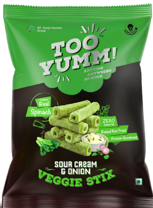
Sour Cream & Onion