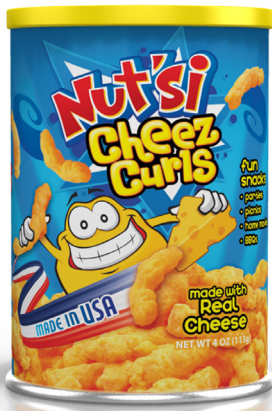
Nut'si CheeseCurls Real Cheese