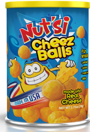
Nut'si Cheeseballs Real Cheese