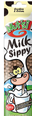
Cookies & Cream